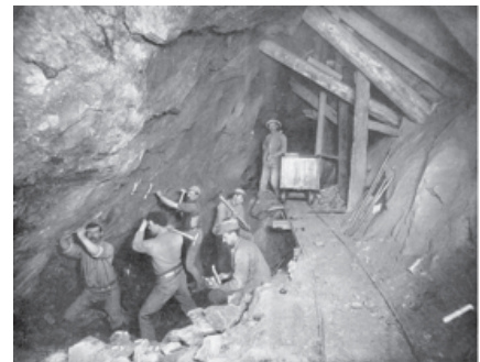
Figure 4: Gold King Mine circa 1899 (Church et al., 2007).

The Gold King Mine was discovered in 1887 and operated until 1922 (Figure 4). There are approximately 23,000 abandoned mines in Colorado where the Gold King Mine is located (Colorado Department of Natural Resources, 2014). As a result, it is only one of many abandoned gold and silver mines located near Silverton, Colorado within the Upper Animas watershed, reflecting more than 120 years of gold, silver, lead, zinc, and copper mining, spanning from 1871 to 1991. During these years an estimated 8.6 million tons of mill tailings were discharged into the waterways (Church et al., 2007). Studies have shown that both natural weathering and continuous acid mine drainage generated from the abandoned mines have impacted water quality in the area, where the water is often acidic and contaminated with heavy metals (Church et al., 2007; US EPAC, 2015).