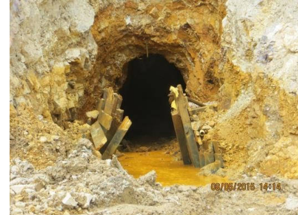
Figure 1: The mining tunnel from which the spill occurred.

On Wednesday August 5, 2015, during a United States Environmental Protection Agency (US EPA) mine site investigation of the abandoned Gold King Mine near Silverton, Colorado, heavy equipment disturbed loose material around a soil “plug” at the mine entrance. Acid mine drainage had built up behind the plug, which unexpectedly gave way due to water pressure in the tunnel, and a torrent of water gushed out (Figure 1). This accident resulted in the release of approximately 3 million gallons of acid mine drainage into Cement Creek, a tributary of the Animas River, which in turn flows into the San Juan River and ultimately into the Colorado River. The water contained a number of heavy metals such as lead and arsenic.