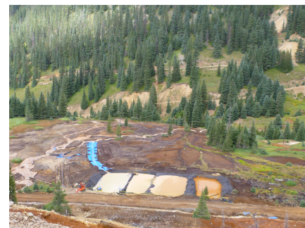
Figure 3: Settling ponds built near Gold King mine allow acid mine drainage to pool, where contaminants can settle to the bottom and acidity can be treated.

Within two days after the spill occurred, the US EPA built settling ponds (temporary solution) to divert additional acid mine drainage flow away from Cement Creek, and treated the water to neutralize the acid and remove solids and metals from the water (Figure 3; US EPAe, 2015). These ponds remain in use as of October 2015. The US EPA has announced it will install a portable treatment system to handle the ongoing discharge (approximately 550 gallons per minute) from Gold King throughout the winter of 2015-2016, as freezing temperatures will make it unsafe to continue to treat it using settling ponds. The treatment system will lower the acidity and remove solids and metals from the acid mine drainage before it reaches Cement Creek (US EPAd, 2015). To date, US EPA has not made a decision about whether to build a long-term wastewater treatment plant at the site (US EPAa, 2015).